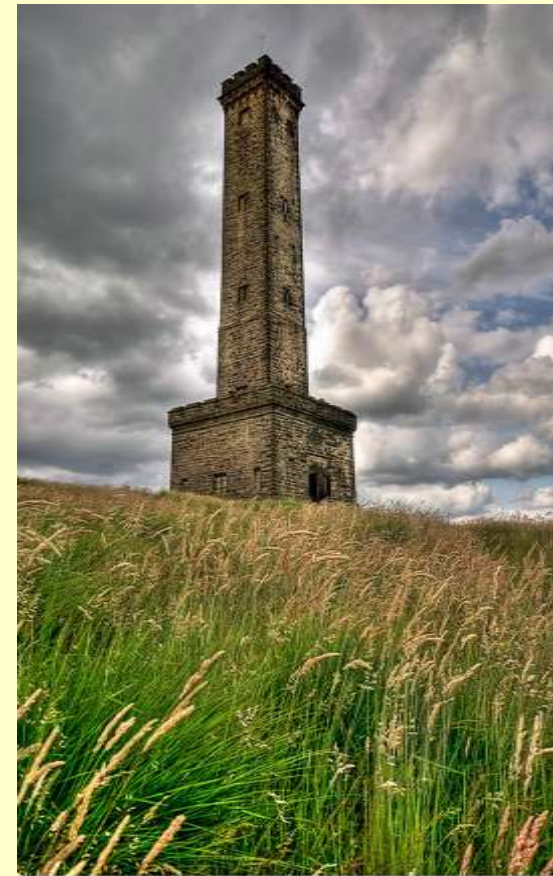
Peel Tower, Holcombe