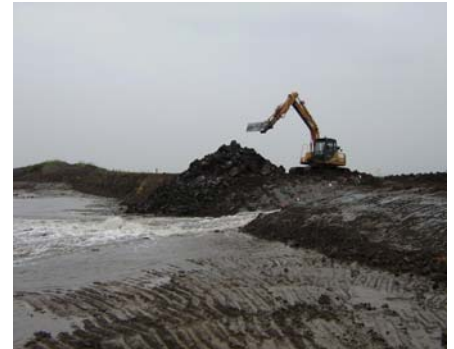
Breaching of the private embankment

The Environment Agency breached the private sea embankment in September 2008 to start the process of recreating the saltmarsh.